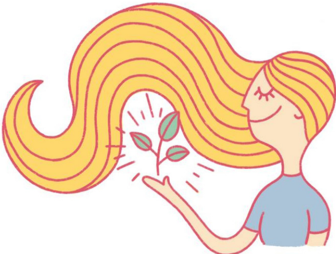
SWEET JACKSON TEA